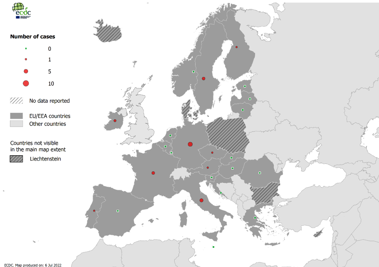
Figure 1. Distribution of Zika virus disease cases by country, EU/EEA, 2020

The number of ZIKV disease cases reported by EU/EEA countries decreased in 2020 compared with 2019 (n=64), and compared with 2016 where the highest number of notifications was observed (n=1 925). Half of the cases reported in 2020 were reported in January (n= 11).